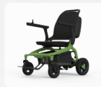
Vibrant Apple Green