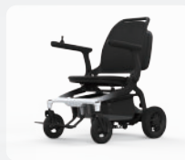
Black and White Gradient