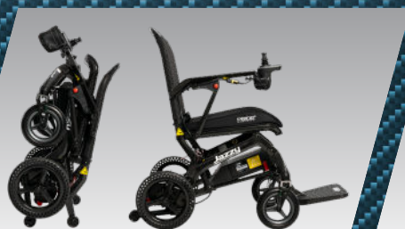
Easy Fold Design that locks into a folded position