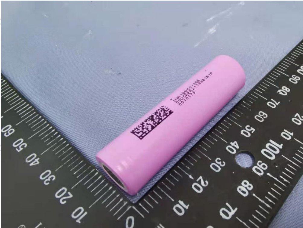
Figure 3 Overall view of cell (电芯图)