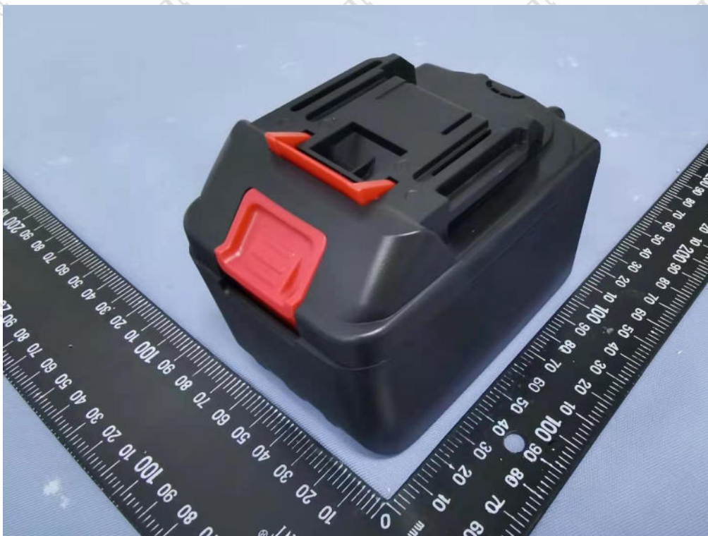
Figure 2 Overall view II of battery (外观图II)