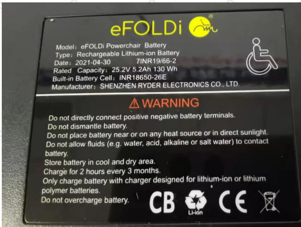
Figure 4 Battery label (电池标签)